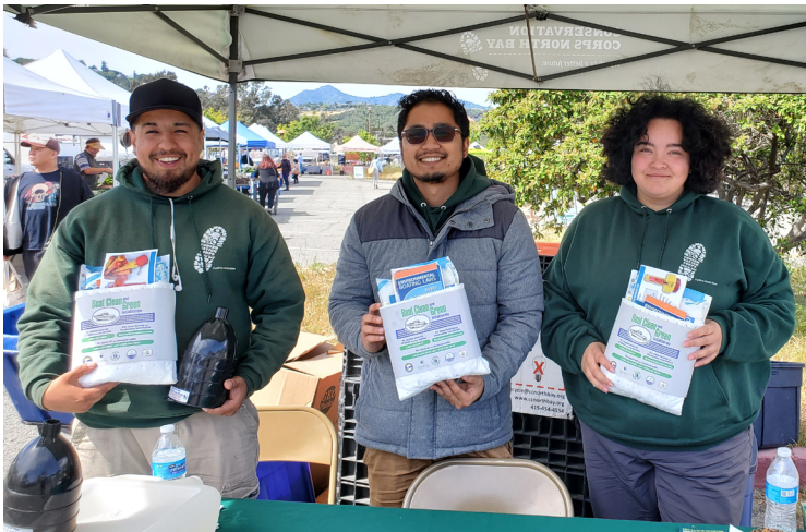
Dockwalkers and Marin Conservation Corps attending an outreach event.