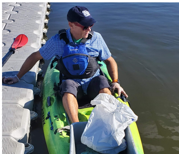
Kayaker participating in Coastal Cleanup Day in Bair Island Aquatic Center (San Mateo County).

While turnout was not quite back to what could be considered “normal” levels, over 35,000 volunteers participated on the day of the event, with 3,237 more taking part in the continued effort around neighborhood cleanups throughout the month of September. In all, close to 300,000 pounds of trash were removed from California’s environment—from beaches, lakes and inland shorelines of all types.