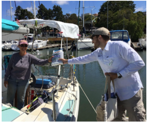
Solano County Dockwalker distributing the CA Boater kit with education.

Next year, program partners will continue to offer more virtual trainings and in-person trainings. The 2023 trainings will be featured on the Dockwalkers' website in January 2023.