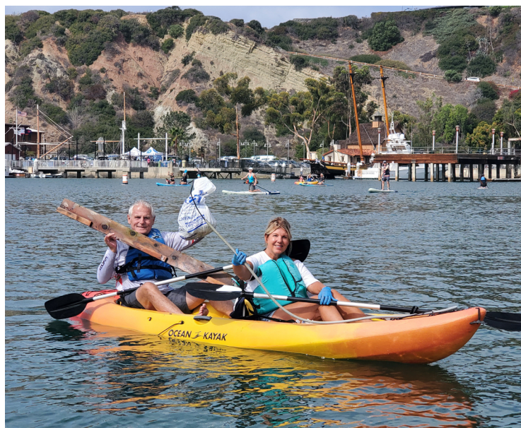
Kayakers from Westwind Sailing in Orange County.

Traditionally the largest annual volunteer event in the country, Coastal Cleanup Day had undergone significant changes during the pandemic, switching to a largely remote model. In 2022, however, public health restrictions had lifted to the point where every county was able to return to hosting in-person cleanups. The relief was palpable—volunteers organized over 600 sites across the state.